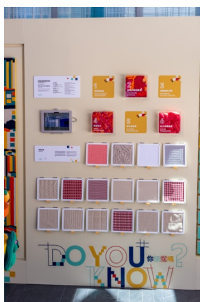
The Billie System (co-developed by Novetex and the Hong Kong Research Institute of Textiles and Apparel (HKRITA)), and eco-yarns

Beyond showcasing artistry, 'Urban Yarns' is a hands-on invitation to rediscover the craft of knitting. This section of the exhibition highlights the work of visionary textile artists and may even spark newfound passions for yarn. Four interactive installations have been designed to demonstrate knitting design's relevance to today's world: