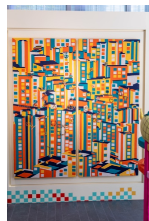
Interactive installation: Co-Creation