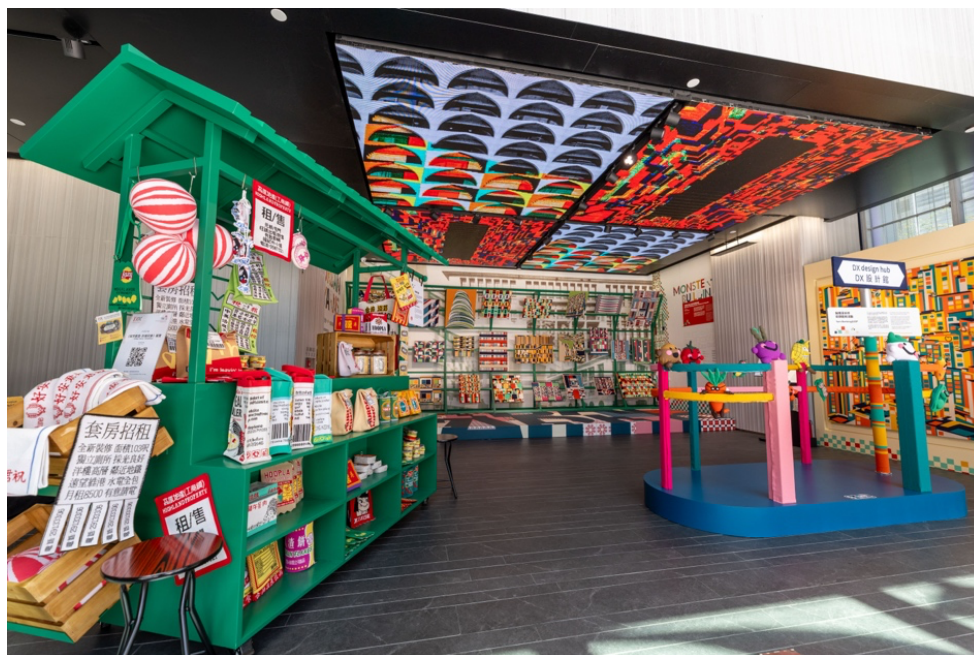
Exhibition view of 'Urban Yarns'

A tactile journey through the city's identity stitches together design, culture, and architecture, using yarn as a stunning medium to explore Hong Kong's evolution