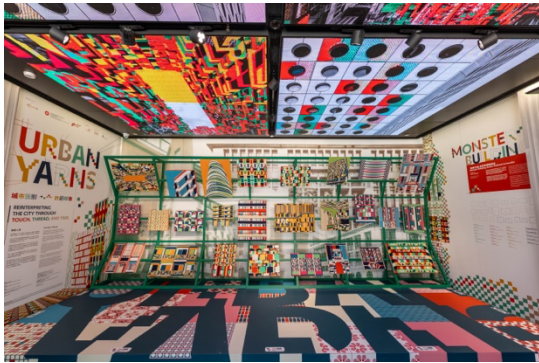
Monster Building Series (Laws Knitters Studio)